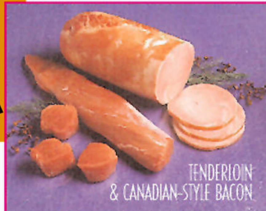
TENDERLOIN & CANADIAN-STYLE BACON